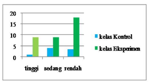
Diagram 2. N-Gain Value of Critical Thinking Ability in the Experiment Class and Control Class Based on the Number of Students

Furthermore, the N-Gain grouping of critical thinking skills is based on the number of students in the experimental class and control class which can be seen in Diagram 2.