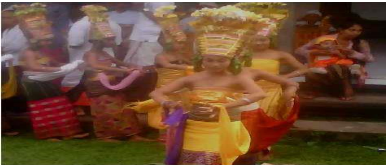
Figure 1. Legong Sambeh Bintang dancer (Doc. Suryani, 2011)

Emancipation actions are needed to create another balance for overcoming distrust, adversity, and subaltern powerlessness in changing fate, as many women experience. 18 Based on the informant's statement above, it can be explained that the Legong Sambeh Bintang dance has long emancipated girls as dancers who have an important position in the religious activities of the people in Bangle Village. This dance has become a form of emancipation for girls in Bangle Village in the context of socially performing arts in traditional cultural structures that are ideally oriented to the patrilineal system. The patrilineal system has been known as the best support system for the preservation of traditional Balinese culture. However, it should be noted that not all girls in Bangle Village can be emancipated by dancing the Legong Sambeh Bintang. In addition to being able to dance the Legong Sambeh Bintang well, those who are selected as actresses are required not to be menstruating and able to not show the character of children during the Ngusaba Desa ceremony as follows.