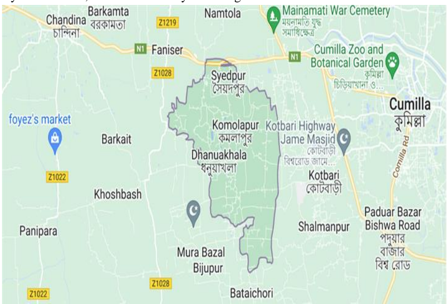
Figure 1: Map of Balunnaghar, Kalirbazar, Cumilla.

Under Cumilla district, there are 17 Upazilas and 180 Unions. It is a Bangladeshi district around 100 kilometers south-east of Dhaka that is surrounded to the north by the districts of Brahamanbaria and Narayanganj, to the south by the districts of Noakhali and Feni, to the east by the Indian state of Tripura, and to the west by the districts of Munshiganj and Chandpur. Comilla district is located in Bangladesh's southern region. The study area is the Balunnaghar village is treated as the agrarian village which is located under the kalirbazar Union that is suited under Adarsha SadarUpazila of Cumilla district. The village is divided into four parts, these are namely north, south, east and west para. This is surrounded to the south by Bolluvpur village, to the north by cantonment, to the east by Donuakhula, and to the west by Komolnghar.