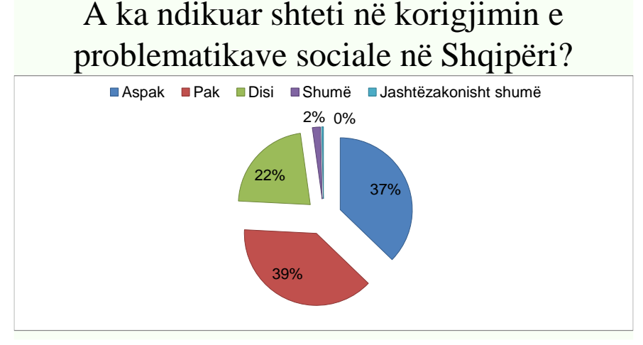
Figura 2 How much has the state influenced the correction of social problems