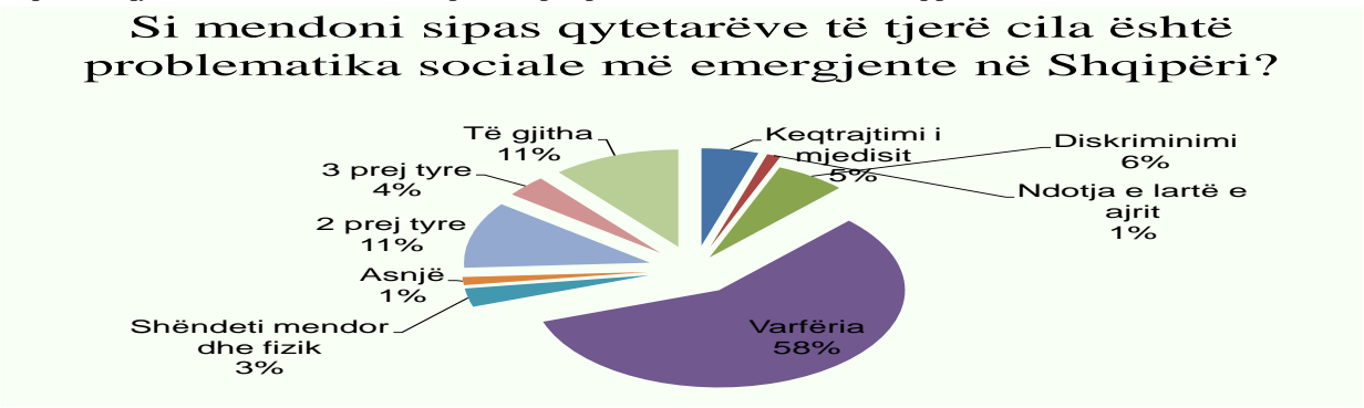
Figura 1 Citizens' opinion on what the public thinks about social issues in Albania 2020

Mendimi që kanë qytetarët se cfarë mendon opinioni për problematikat sociale në Shqipëri 2020