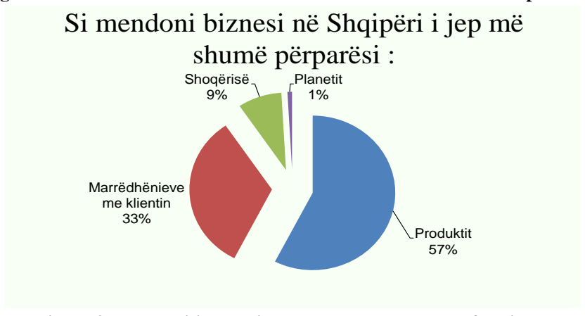
Figura 3 How do citizens think about the advantages of business