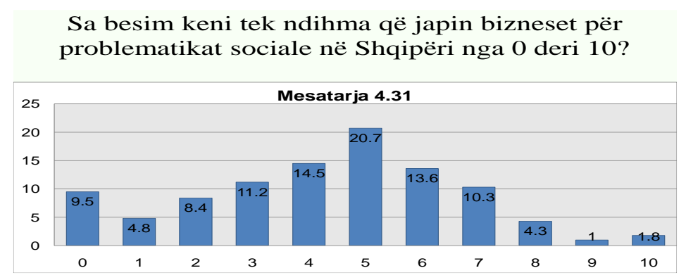
Figura 4 How much trust do citizens have in the help that business provides for social issues