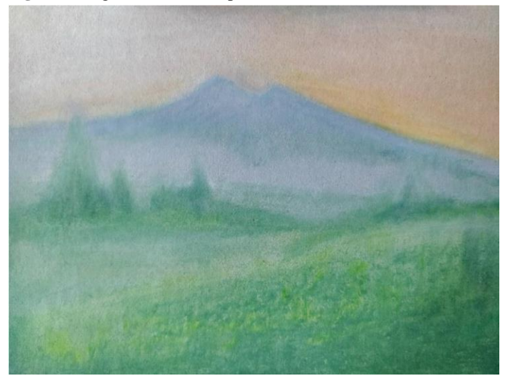
Fig. 6. Dialogue, aesthetic response.