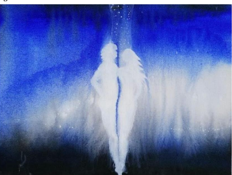
Fig. 5. Art session.