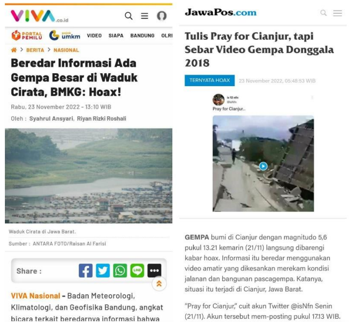
Picture 3. Viva.co.id and Jawapos.com found misinformation and hoaxes circulating on social media.

In the midst of natural disasters and rampant information on social media, journalists must be able to convey true, objective and accurate information. This is because journalists have the legitimacy of the news broadcast ed to the public (Muqsith et al., 2022). This is because, in the event of a natural disaster, information on social media flows very fast, even bringing up unrelated videos and pictures claimed to be sourced from the actual situation.