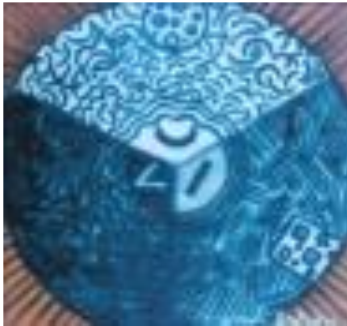
Figure 8. Mandala Tiga Garis (Doc: I Dewa Nyoman Batuan, 1998).