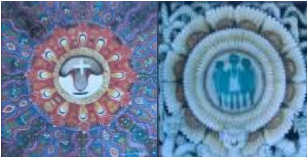
Figure 4. Mandala Rwa Bhineda (Doc: I Dewa Nyoman Batuan, tahun 2003).

From reality try to believe, develop, multiply, and lay eggs, Happens because of intimate love, From him, God, Purusa, or a man called the Phallus, Predana or a woman called Yoni, Created nature and its contents. "