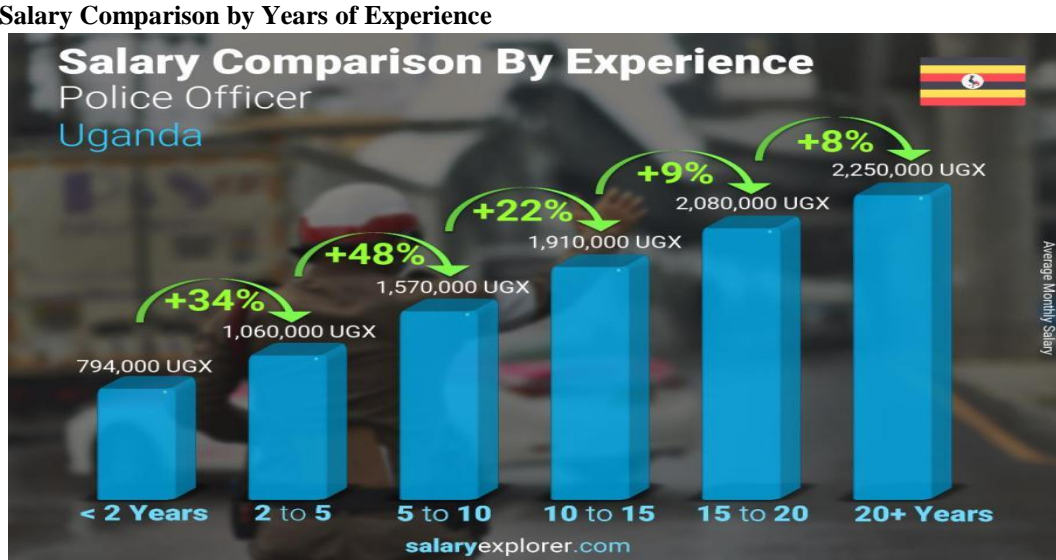
Police Officer Salary Comparison by Years of Experience

Effects of lack of Accountability and corruption in the Police; be it in Uganda, corruption has brought the Force into public disrepute and ridicule. People have discredited its professional competence. Deserving people are denied services they are entitled to and instead the criminals who have the money pay their way out of the crimes they have committed. Indeed, people sometimes feel that they go to the police because they have no other choice. Many have thus resorted to taking the law into their hands (ONS Dec 2013, Low Pay, April 2013)10.