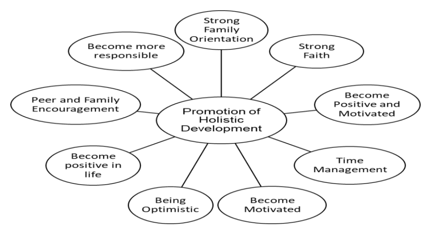
Figure 2. Indicator of Success Stories of Working Students in an Online blended ModeDelivery

Figure 2 presents the qualitative findings of the success stories of working students in an online-blended mode delivery of learning amidst the covid-19 pandemic. The study comes up with nine (9) basic themes that include: Become Positive and Motivate, Time Management, Become Motivate, Being Optimistic, become positive in life, Peer and Family Encouragement, Become more responsible, Strong Family Orientation, and Strong Faith. The study has one (1) emergent theme that includes: Promotion of Holistic Development.