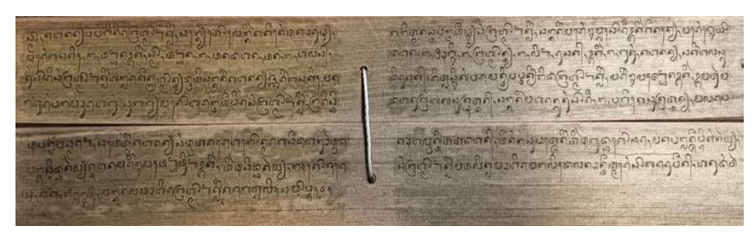
Figure 10. Ancient Script about Sidakarya Mask.

return was crucial to restoring balance and prosperity. From that moment on, Dalem Waturenggong declared that every Hindu performing a Religious Ceremony must conduct the "nunas tirta" ritual, thereby ensuring the success of the ceremony, which became known as "Sidakarya." The history of the Sidakarya Mask and the Pemuteran Jagad Sidakarya Temple illustrates the significance of reconciliation, spiritual wisdom, and the belief in restoring harmony for the welfare of the people and the land of Bali.