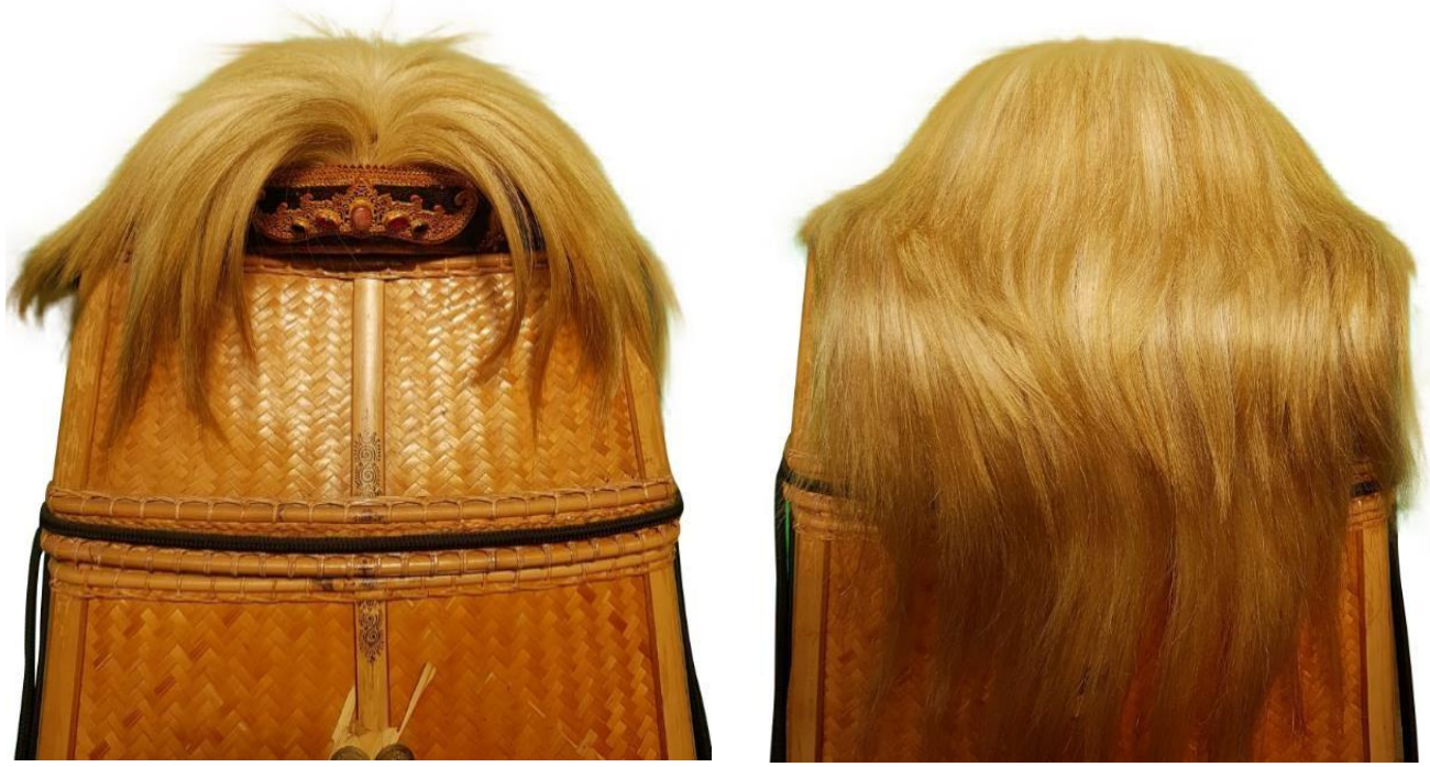
Figures 3 & 4, the crown (gelungan) Sidakarya Mask.