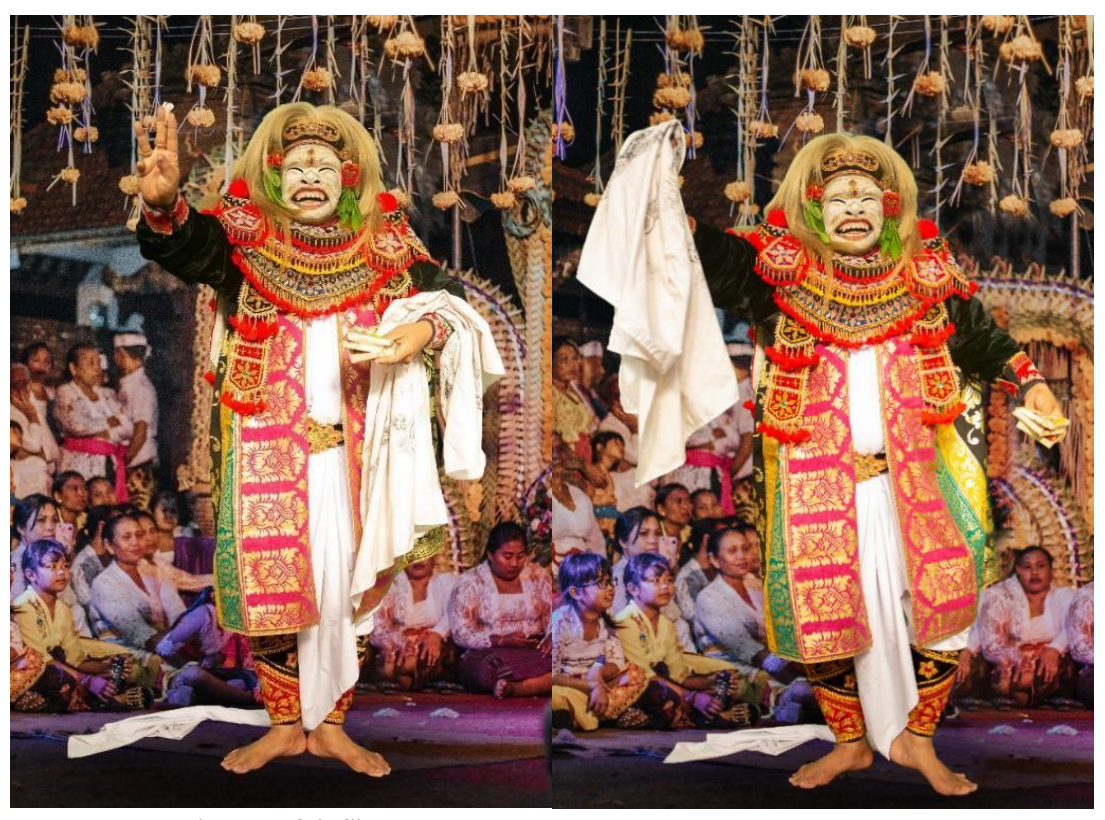
Figures 7,8,9. Sidakarya Mask Dance.

According to A. A Bagus Sudarma, an esteemed mask artist, the presence of the Sidakarya Mask serves to address any shortcomings or deficiencies in the ceremonial preparations. It offers completeness to the ceremony and appeases the spirits, ensuring that the religious ceremony proceeds smoothly. At the end of the Sidakarya Mask dance performs the "pedanan" ritual, sprinkling yellow rice to symbolize prosperity and harmony for family members and relatives. The act of sowing yellow rice is believed to bring prosperity and peace to the family and all those involved in the religious ceremony. The presence of the Sidakarya Mask in Balinese ceremonies holds deep cultural, spiritual, and symbolic significance. Its role as a witness, communicator, and completer of the ceremony highlights its importance in maintaining the balance between the visible and invisible realms, enriching the cultural and religious experiences of the Balinese people.