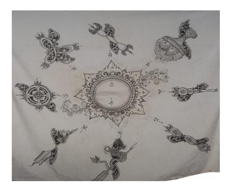
Figure 1. Sidakarya Mask. Figure 2. Kereb is a headdress, an additional property used in performing Sidakarya Mask, as a chest cover, and depicting the weapons of The "Dewata Nawa Sangga" which refers to the nine deities worshipped in Balinese Hinduism.