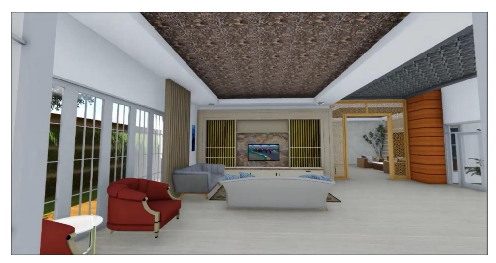
Figure 2. Application Engineering Design of Metal Ceiling in the Living Room (Illustration Photo by Aan Sudarwanto, 2023)

The use of metal ceilings does not only focus on decorative elements but also integrated functionality. In modern designs, metal ceilings are often integrated with concealed lighting, ventilation, and sound systems. This creates a clean, minimalist look that is not only aesthetically pleasing but also optimizes space usage. In spaces with metal ceilings, technology devices, and everyday utilities can be seamlessly integrated without compromising on visual beauty.