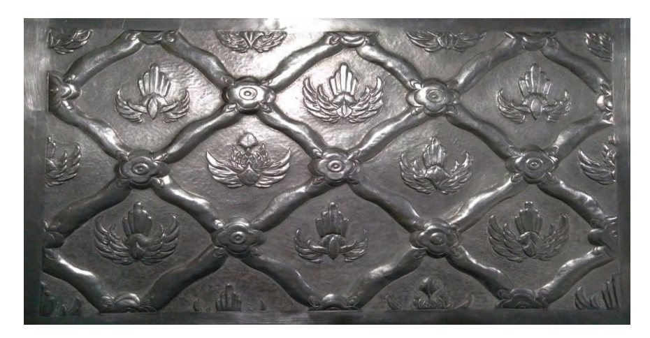
Figure 3. The Invention Result of Batik Motif Application in the Form of Ceplok Gurda on a Metal Ceiling, Namely Aluminium

After the inlay is finished, the batik-patterned metal ceiling will go through the finishing stage. Metal surfaces can be given a protective coating to prevent corrosion and provide a beautiful shine. In this creative work, finishing is done by polishing, so it gives a shiny impression. The finish of the metal ceiling with batik motifs produced through inlay techniques is a unique combination of cultural heritage and modern artistic craftsmanship. The beauty of the batik motifs that adorn the metal ceiling not only decorates the room but also reminds us of the value of beauty and cultural diversity.